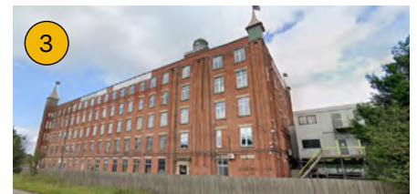
Existing Site Views