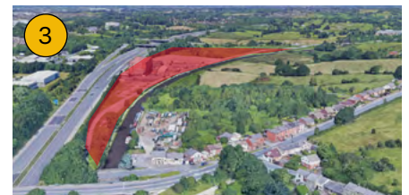
Existing Aerial Views