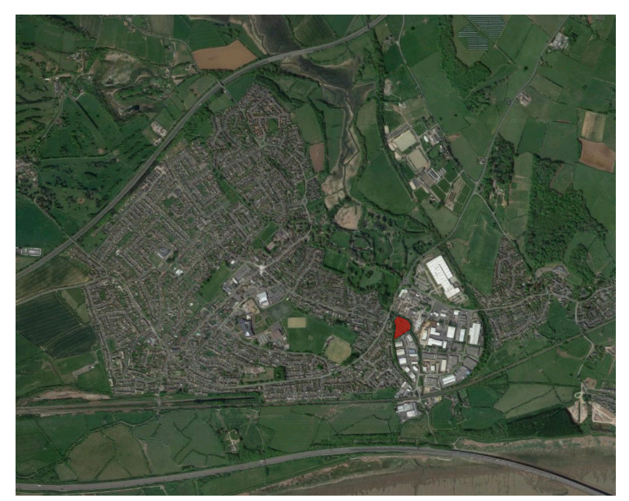
Site Location (Shaded Red)