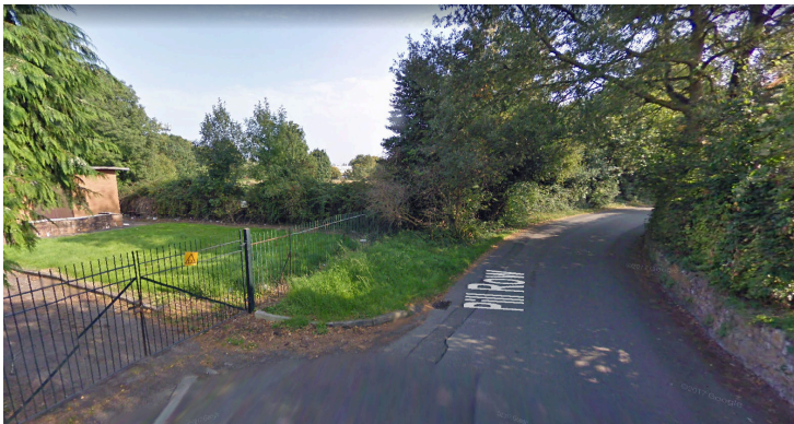
Image of site from Pill Row