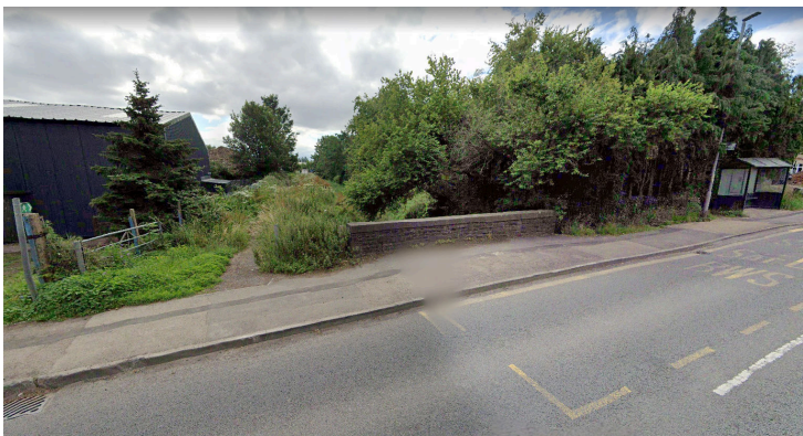
Bus Stops at Nedern Bridge