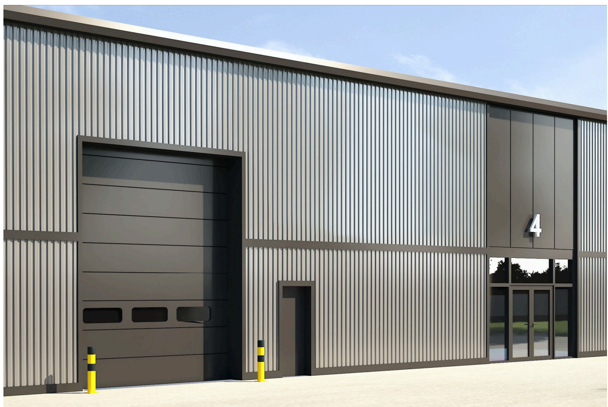
Types of cladding to be used