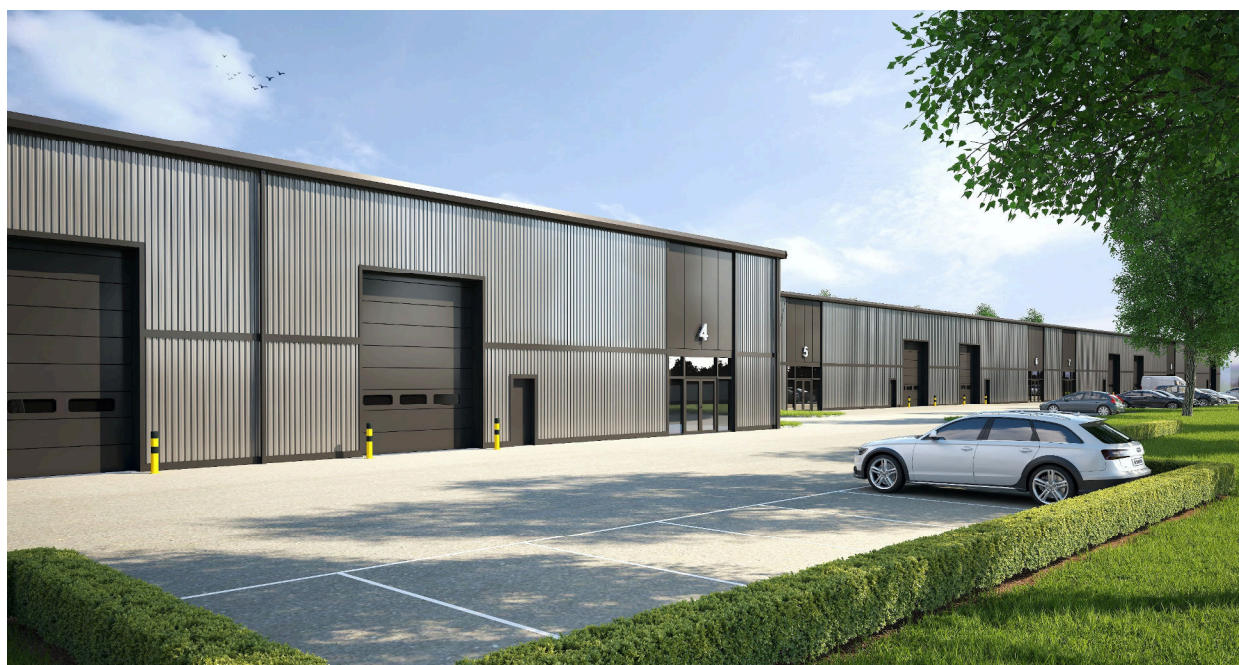
CGI of the proposals