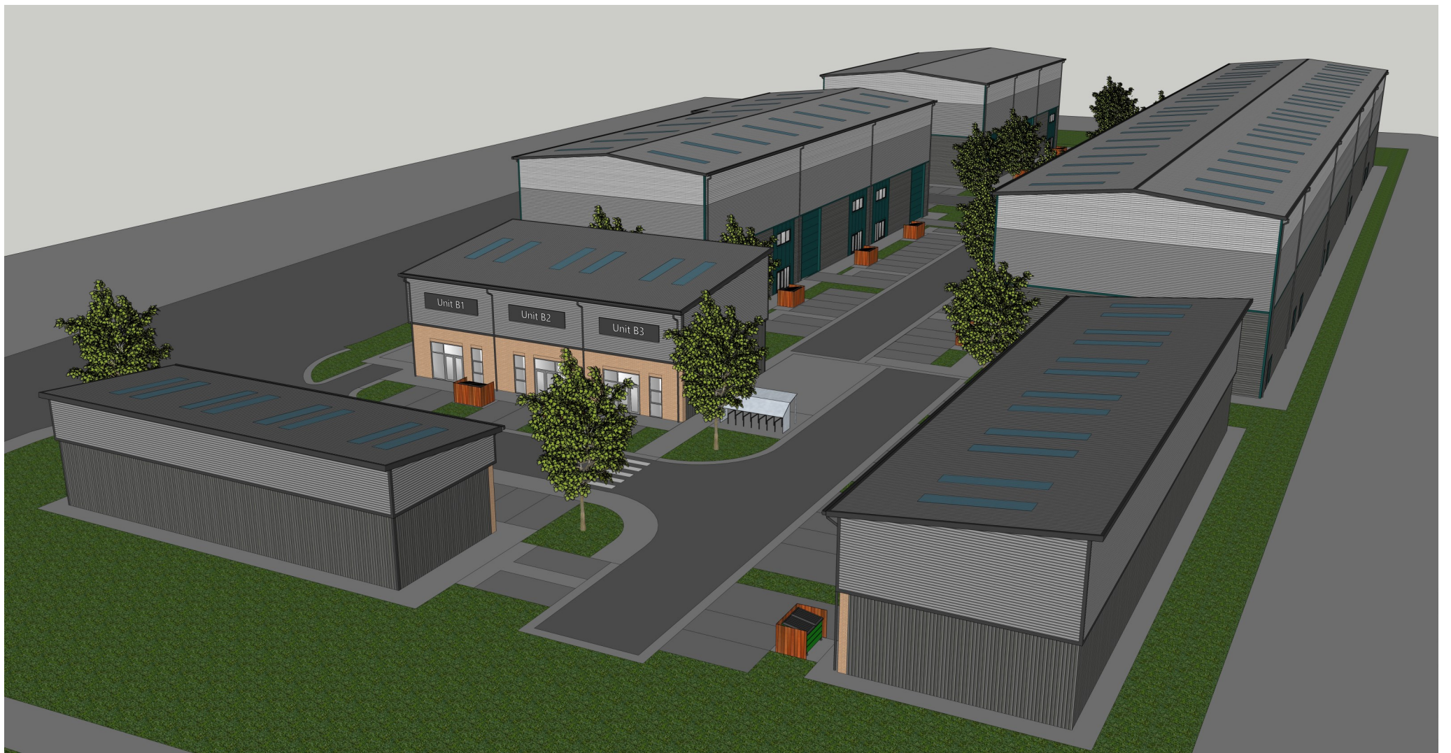
CGI of the proposals