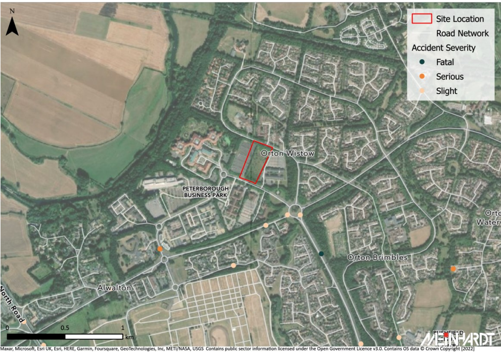
Road Network Accident Severity