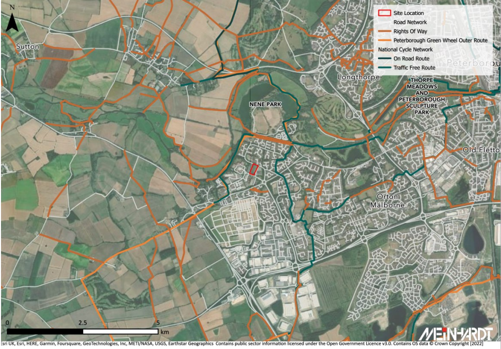
Walking and Cycling Routes